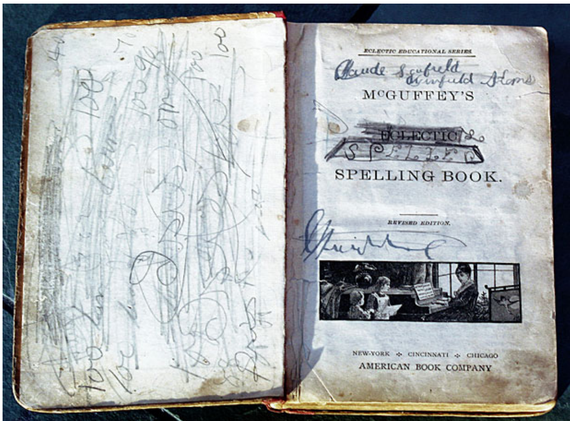
McGuffey's Eclectic Spelling Book, published in 1879.

The teaching of reading and writing has been a major part of the schooling mission for over two centuries. It has also been on the minds of countless specialists who ponder gaps in formal education in both expected and unexpected sectors of the public. That everybody should know how to read and write is taken for granted. However, beyond vague truisms regarding its function, there is little discussion about how those abilities are used. And yet the